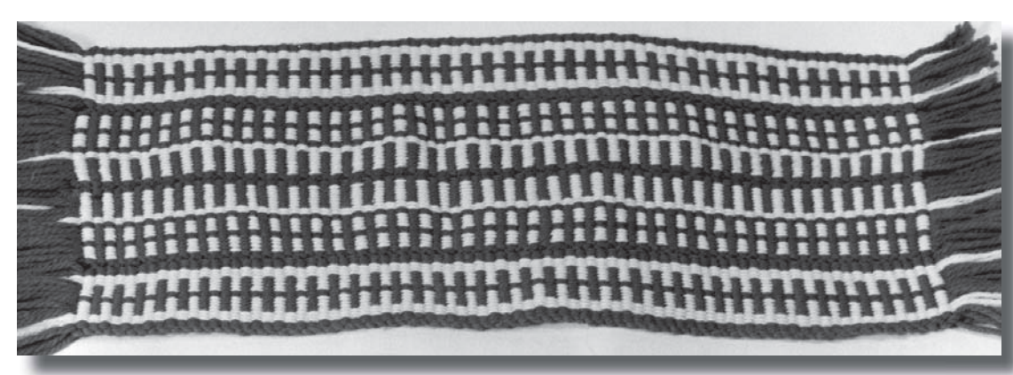
Woven by Helene Bress.

For a warp faced fabric, the warp threads are set about twice as close as they usually are. Because of this, it is often difficult to separate the sheds easily. Smooth yarns are advised. Narrow warps or spaced warps are easiest—but wide rugs may be made. If the warp threads can be spread out over more than two harnesses, shedding will be easier. Sometimes the reed is removed and the weft beaten in with a hand beater.